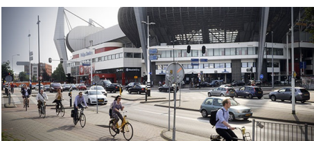
Our business lines